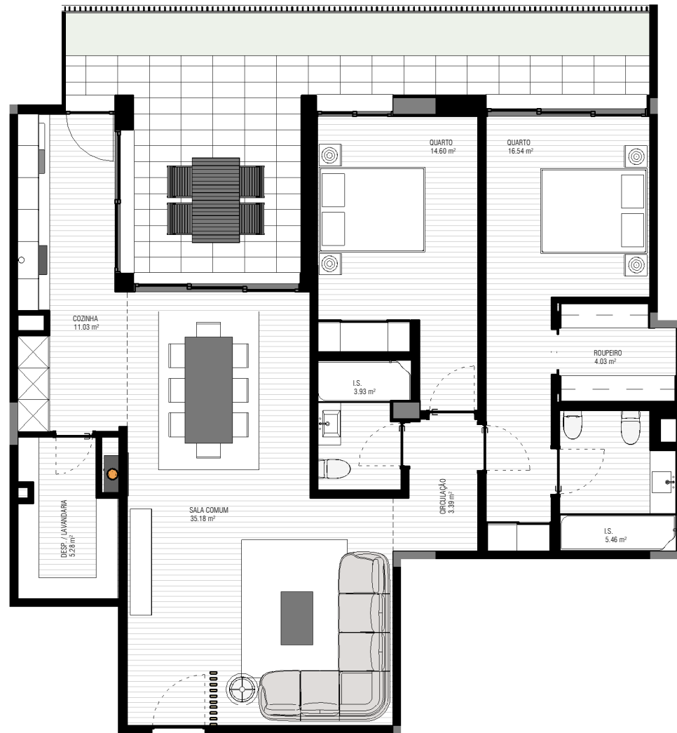
B - FRACÇÃO 1:100