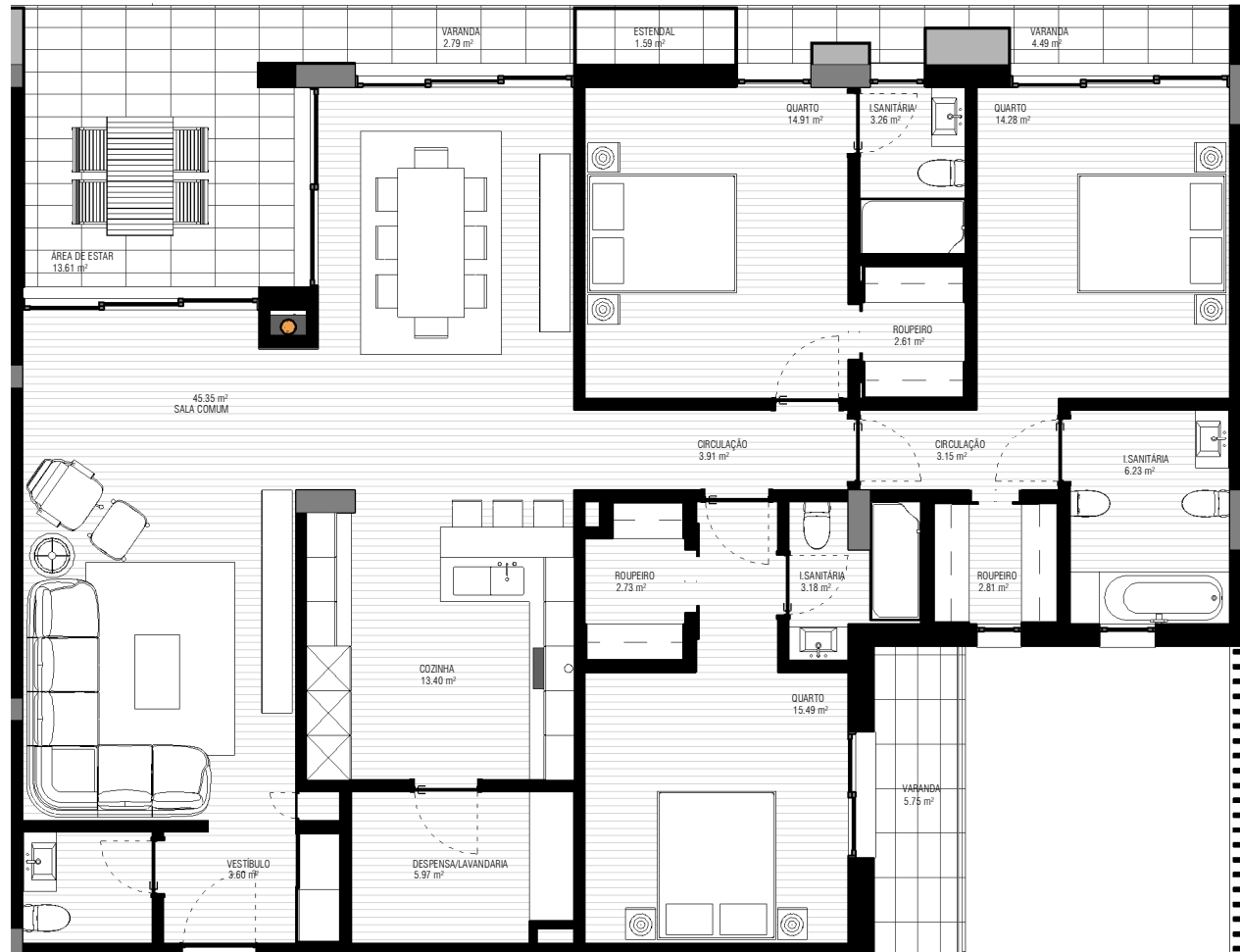
G - FRACÇÃO 1 : 100