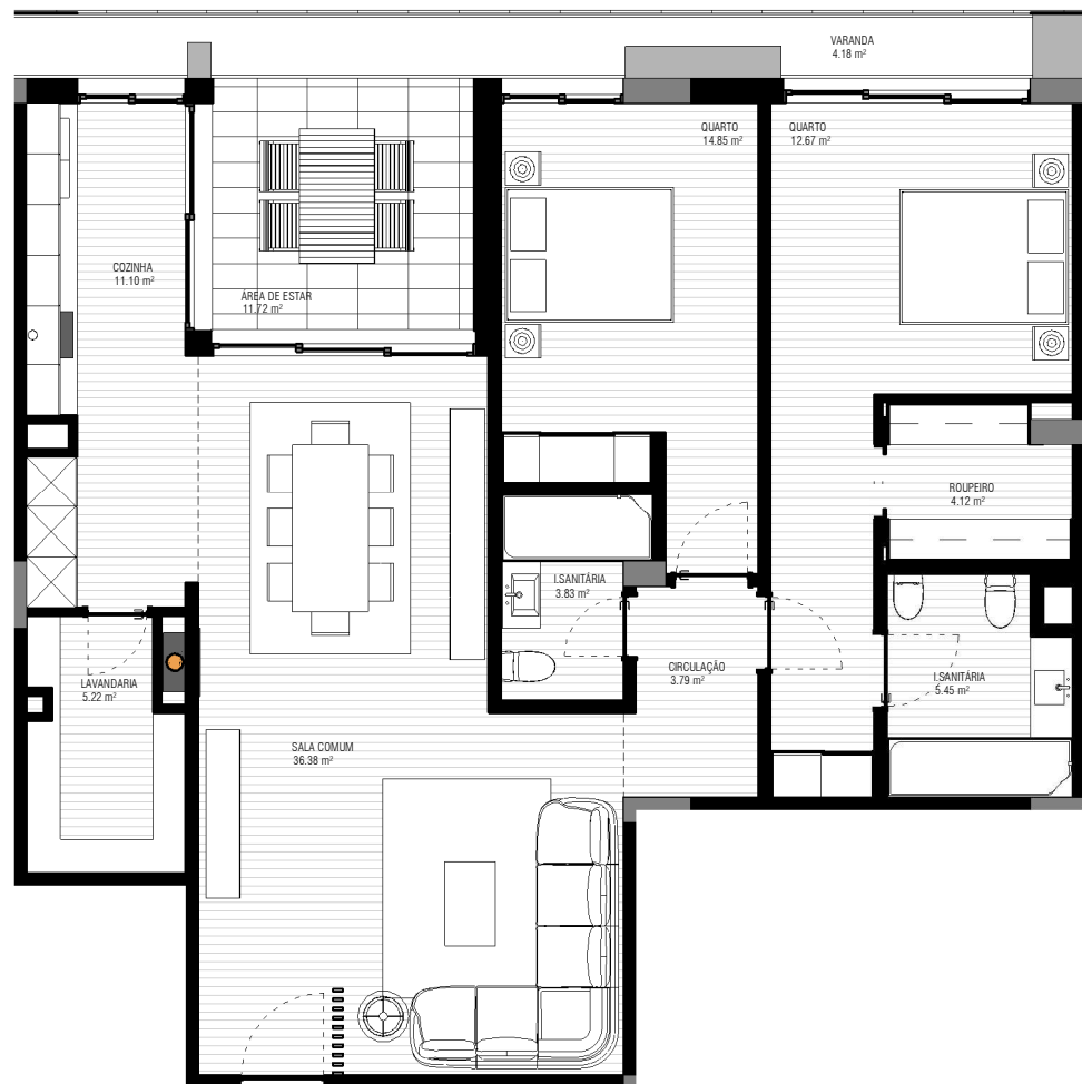
H - FRACÇÃO 1 : 100