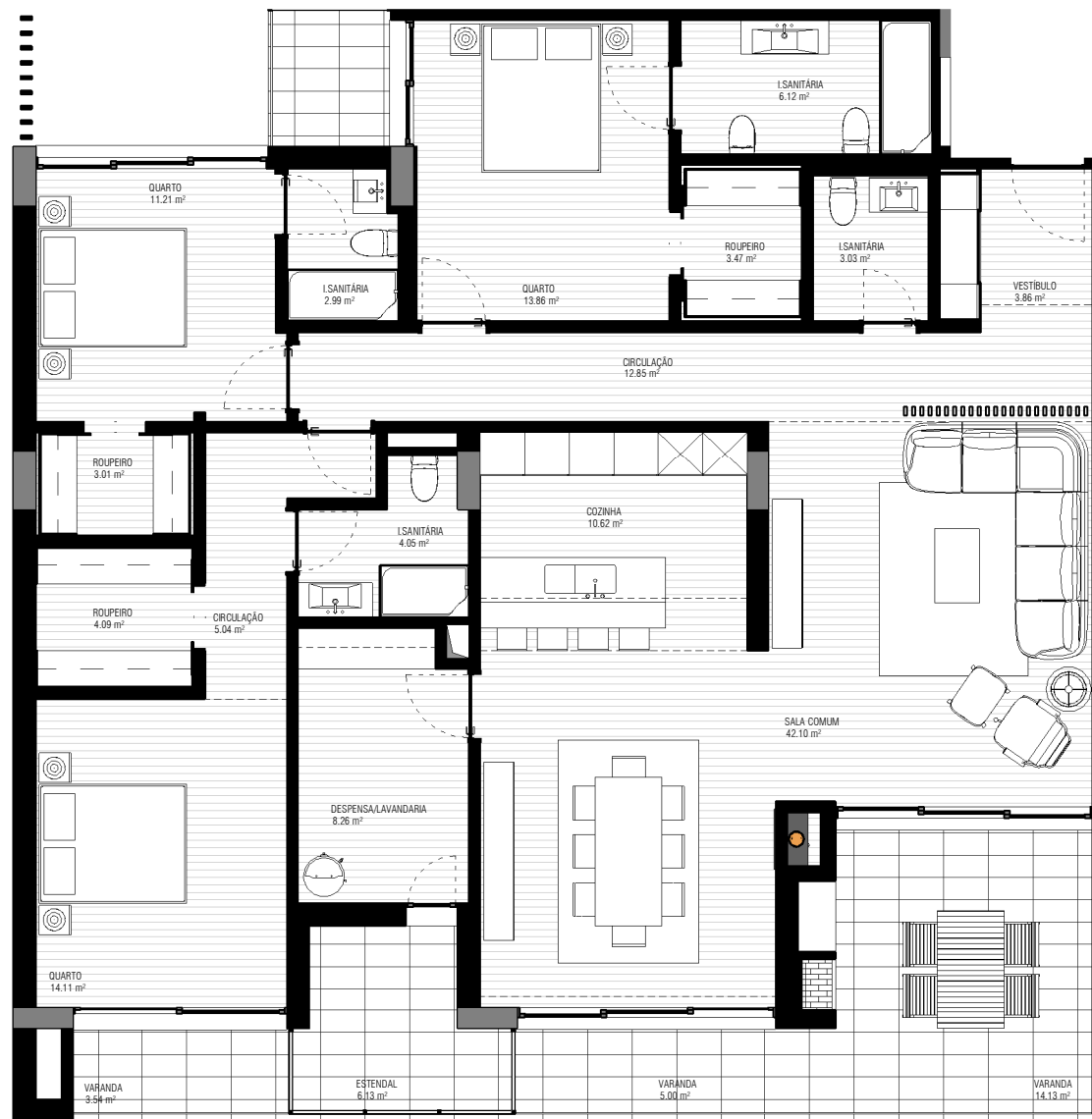
J - FRACÇÃO 1:100